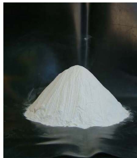
Product-High Purity Silica Flour

On-going product improvement investigations are aimed at further expanding the size of the current resource. The current resource could support a project life well in excess of 10 years at an annual production rate in the range of 25,000 – 50,000 tonnes of saleable, high purity silica flour for export primarily into the TFT-LCD industry. The production of other display glass substrates, and for a wide range of applications in specialist niches of technical, scientific, optical and other high quality glass. The operation would also generate a co-product of about 10,000 – 20,000 tonnes per annum of low-iron silica sand.