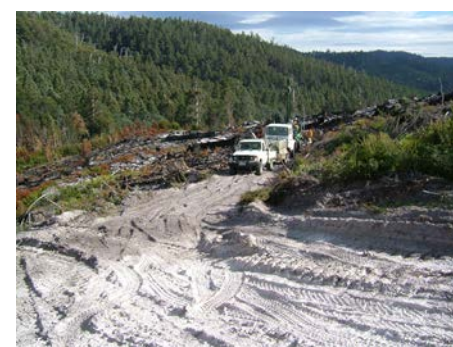
Resource Definition drilling

At around 35-40% by weight, the naturally occurring silica flour, identified as the economically most significant component of the deposit's sand mix, can be upgraded to high purity, high value products attracting price premiums for a range of niche applications primarily in the global, high-tech sector of the glass industry. The low iron silica sand by-product could realize additional commercial benefits.