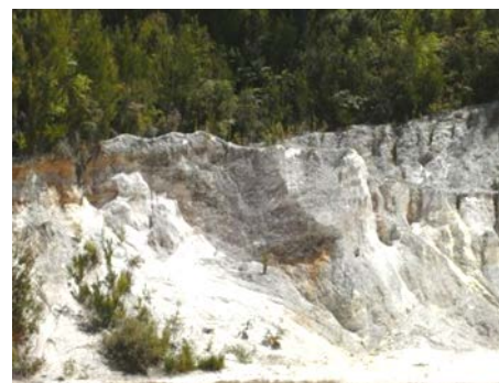
Old Sand Quarry

The proposed main end-product, likely to rank among the best in the world, is high purity, low iron silica flour mainly for the production of various glass substrates for the display industry and for other specialist glass products. Recently completed environmental base line studies did not reveal any impediments to development.