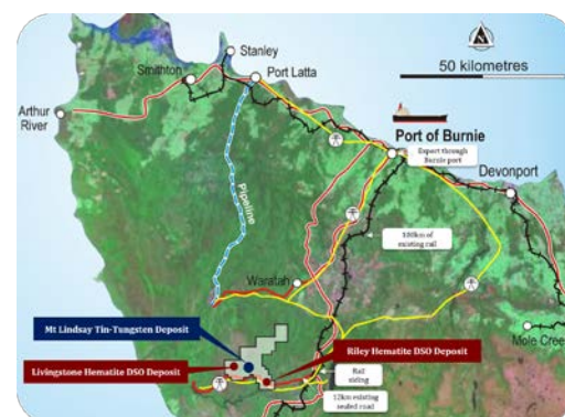
Location of Mt Lindsay, Livingstone & Riley

The Livingstone DSO Project is located only 3.5km from Venture's Mt Lindsay deposit and consists of an outcropping hematite cap overlaying a magnetite rich skarn. The Riley DSO Project, located 10km from the Mt Lindsay Project, sits at surface and is less than two kilometres from a sealed road that accesses existing rail and port facilities.