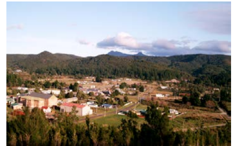
Zeehan Town & Queen Hill: Heemskirk Project

Disclaimer: The information in this paper has been prepared with care, but no warranty is given as to the information's correctness, completeness, currency or suitability for any purpose. No liability is accepted for any advice given, omissions or however else arising, including but not limited to negligence for any loss resulting from the use or reliance on any information. Readers should seek their own independent legal and financial advice.