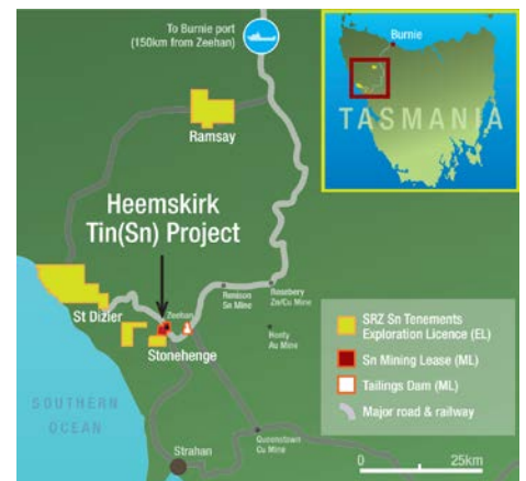
Heemskirk Tin Project location