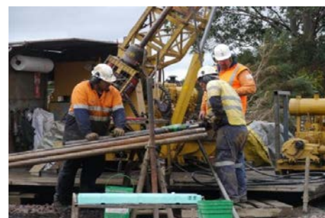
Drilling rig at Heemskirk