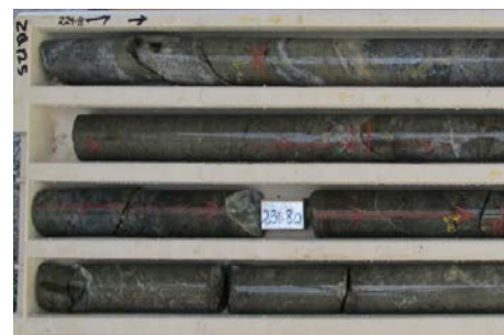
Heemskirk Core: Part of high grade tin zone (7m @ 1.67% Sn average, incl 1m @ 5.55%)

In May 2017, Stellar commenced a 9,000m diamond drilling program aimed at upgrading Inferred Resources to Indicated in support of a Definitive Feasibility Study. The company plans to complete the study in mid-2018. Financing and construction over the following 12 months should see tin production by mid-2019.