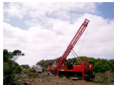
Drilling rig conducting geotechnical work