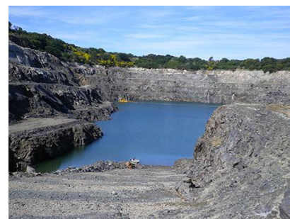
Dolphin open cut mine, dewatering underway