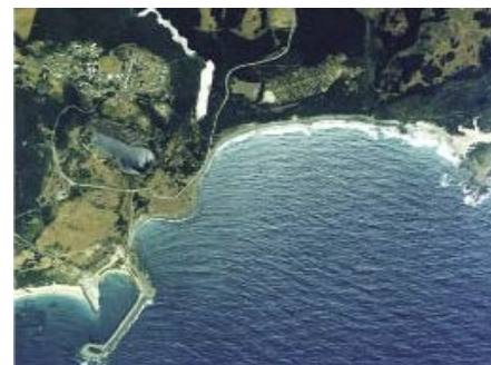
Current restored site